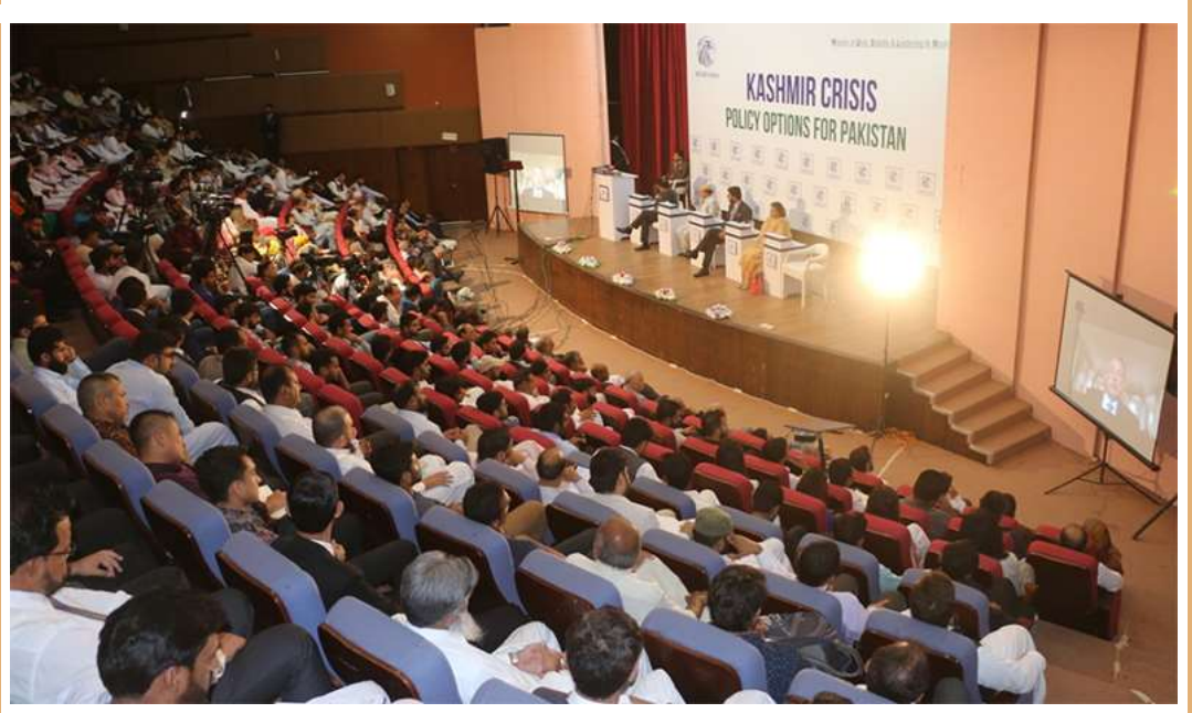
Participants and stage view of seminar.

contents of these reports highlight the facts and figures, what India is doing today in the garb of integration