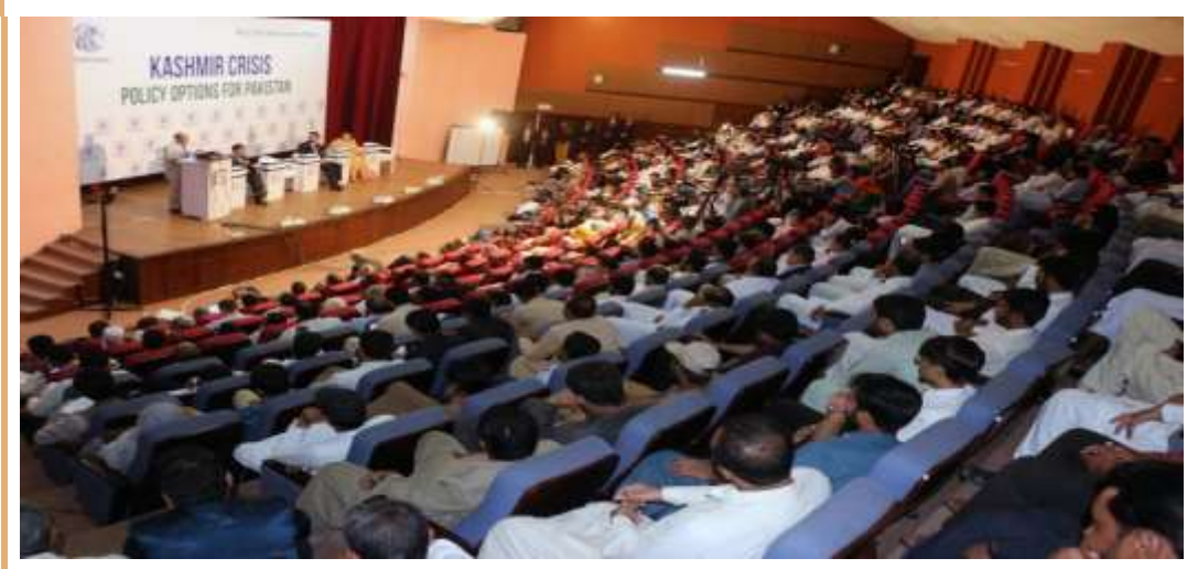
Hall View during the Seminar.

The summary of remarks shared by expert panellists are as follows: