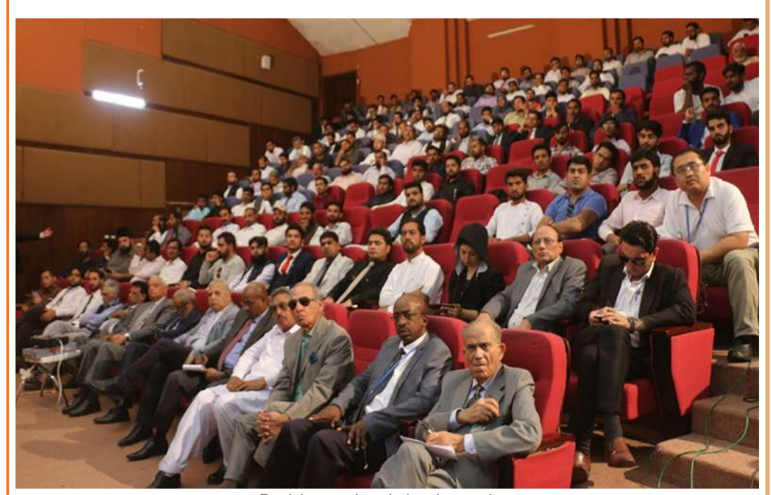
Participants view during the seminar.