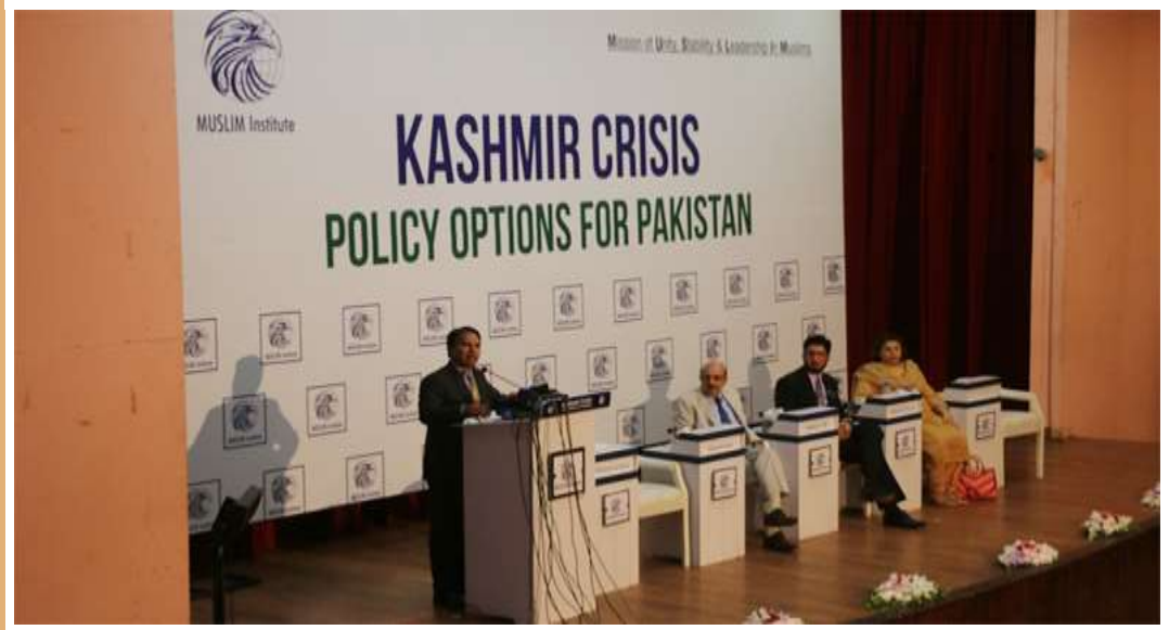
Stage View during the Seminar.