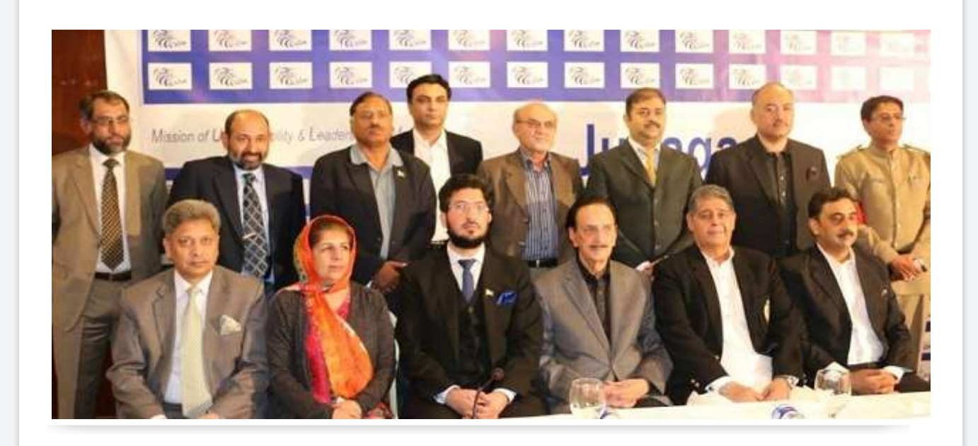
Copyright © 2015 - MUSLIM Institute www.muslim-institute.org

> The facilities to his Excellency Nawab of Junagadh should be extended from the government of Pakistan in recognition of his sacrifices and to ensure that he can handle this case more effectively.