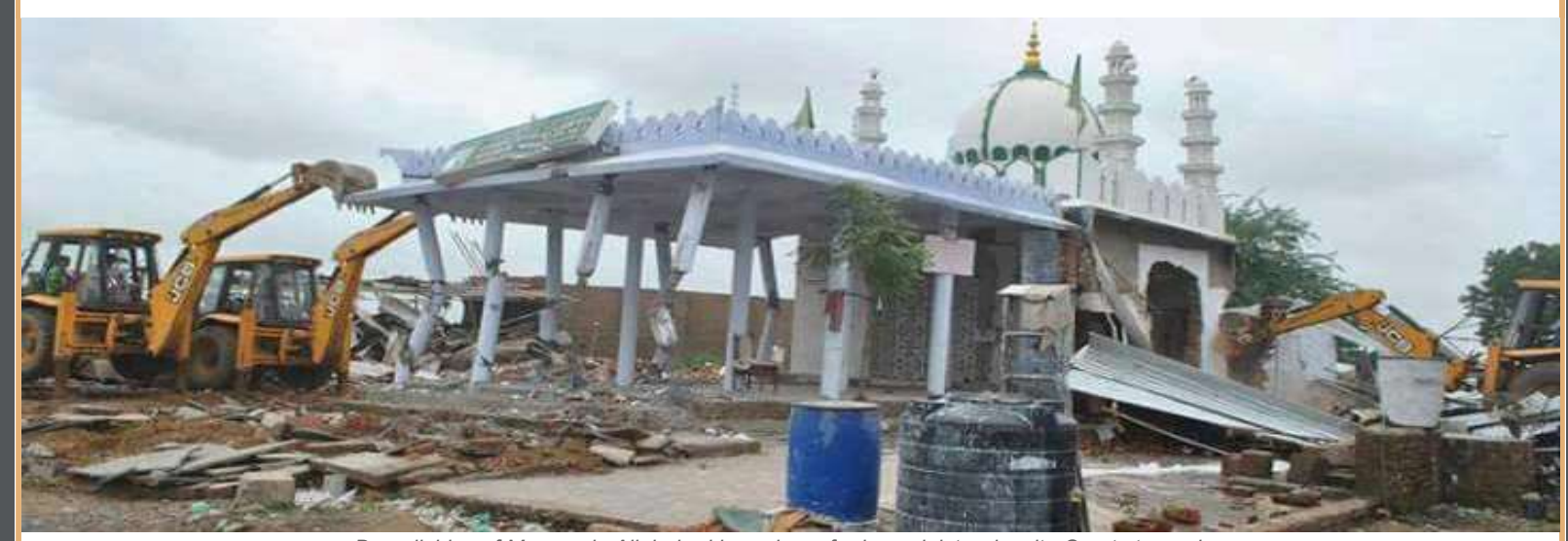
Demolishing of Mosque in Allahabad by orders of prime minister despite Court stay order.

Although the minorities in India have been discriminated and remained the victim of extremist Hindu hostilities since its independence, the tensions between Hindus and Muslims multiplied after Rashtriya Swayamsevak Sangh (RSS) backed extremist Bharatiya Janata Party (BJP) formed government. The victory of the BJP in May 2014 posed a severe menace to minorities through violence, discriminatory attitudes, forced conversions and harassment. BJP leaders publicly promoted Hindu supremacy and ultra-nationalism, which encouraged further violence. Human rights watch releasing its world report 2018 illustrates well, how Mob attacks by extremist Hindu groups affiliated with the ruling BJP against minority communities, especially Muslims, continued throughout the year.