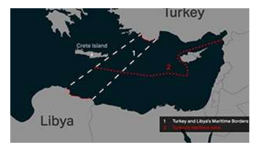
Turkey-Libya maritime deal

Recently, the Libyan fighters, allied with the GNA, advanced towards the strategically important port city of Sirte that is a gateway to important oil terminals. A few months ago, the maritime delimitation agreement between Turkey and UN-backed GNA in