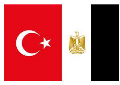
Turkey-Egypt Flags, via timep.org

construction of the dam which will adversely impact the Egyptian economy in future. Thirdly, Egypt aims to achieve very little in its maritime deal with Greek Cypriot. However, if Egypt agrees with the principles of Turkey and Libya, it can achieve much more. Lastly, the economic situation in Egypt is vulnerable. Keeping in view the aforementioned issues, it can be argued that Egypt may not be willing to intervene in Libya and these statements could be deterrence tool against Ankara-backed forces of GNA. However, there are chances that other foreign actors might support and push Egypt for this move. Similarly, Turkey is already engaged on multiple internal and external fronts such as political support at home and military operation in Syria. It would not be in favour of Turkey to start another war-front. However, if Egypt intervenes into Libya to support Gen. Haftar's forces, the war between Turkey and Egypt, including several other allies, would become inevitable thereby leading towards regional chaos and instability. In case of a conflict between Turkey and Egypt, Libya would become another Syria.