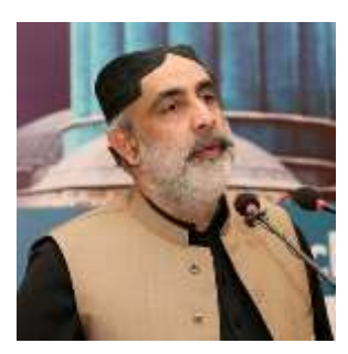
Sahibzada Muhammad Mehboob Sultan Federal Minister for States and Frontier Regions

All the wars of the world are the outcomes of hatred. If we set aside our hatred, what we are left with is love. Our creator is One. Our Lord wants us His confluence. O man! this world was meant to be an abode of worship but you fell victim to lingual, regional, religious and state divisions. We need to unite and have to realise its reflection in everybody. Thus, we have to have a balanced love for every creature. Only then we can achieve His happiness. We can learn from flower as how to smile ourselves and make others smile. As Hadrat Sultan Bahoo (حصتالله ( حصتالله the use of it moving beads of rosary does not move heart, what is the use of it – Hoo"