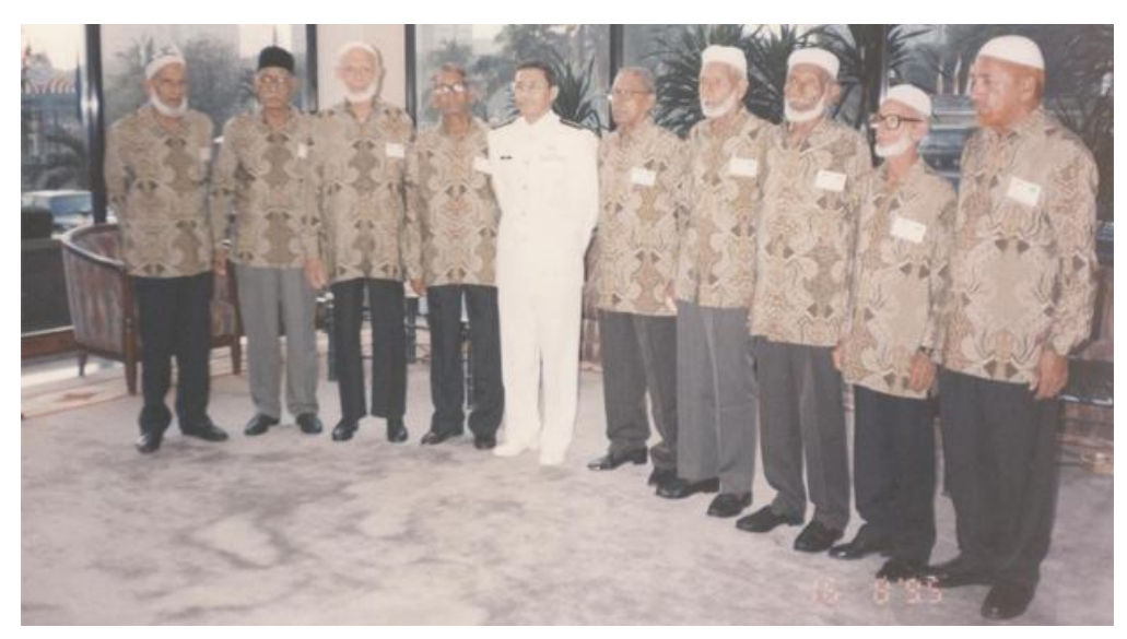
Group photo of some Soldiers with Indonesian Naval officer in Jakarta August 1995, who were given highest military awards in reorganization of their sacrifices for Indonesia.

Indonesian brothers he was presented with "Adipura", highest civil award.