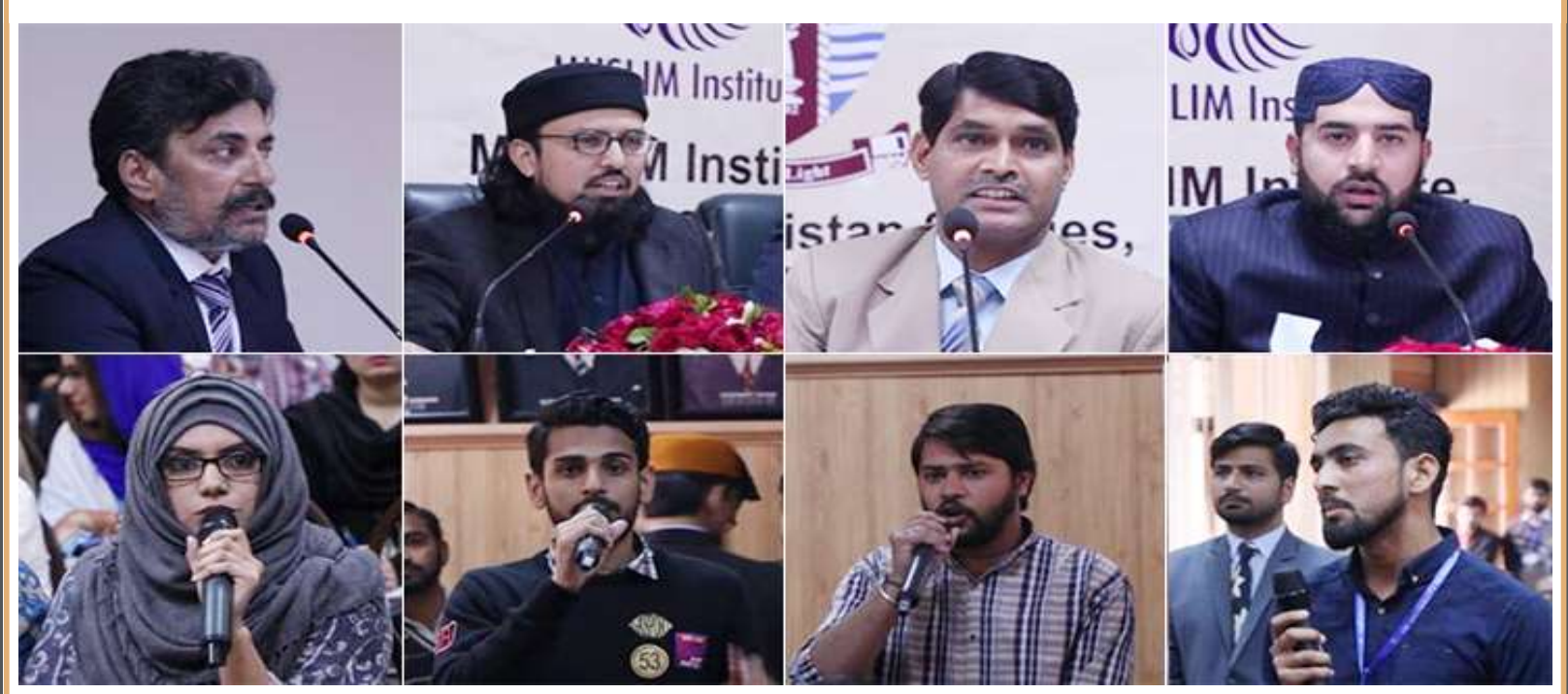
Participants asking questions during the interactive session of conference.

An exchange of views between speakers and participants during the interactive session is as under: