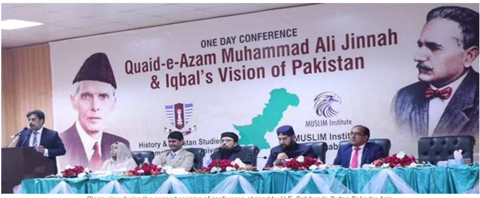
Stage view during the second session of conference chaired by H.E. Sahibzada Sultan Bahadar Aziz.

of Quaid and the dream of Iqbal. For the very purpose, we have to seek the resolution of our prevailing differences with the promise that we shall stand by democratic values and love this holy land.