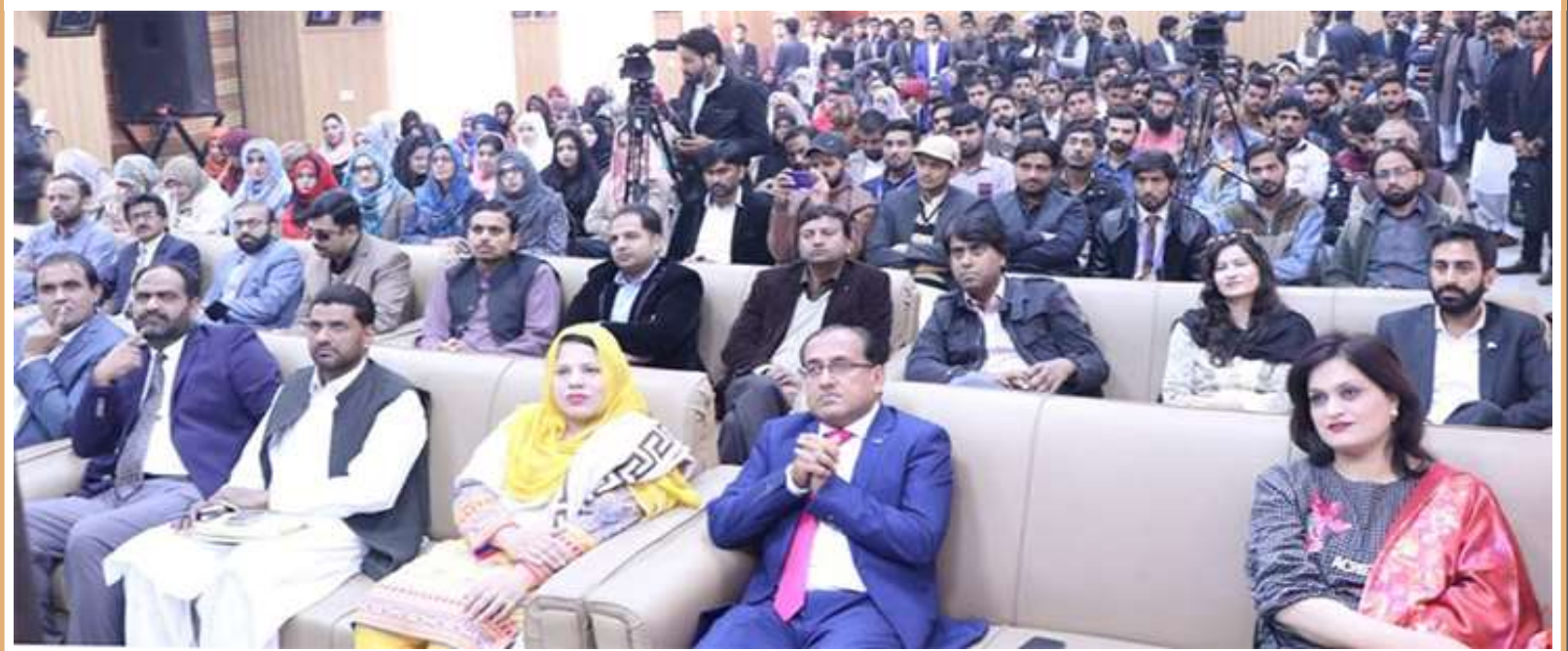
Participants view during the conference.

It is very unfortunate that Pakistan is among those very few countries where national heroes are being questioned. It is being questioned today that why Pakistan was created and what kind of Pakistan was envisioned by Quaid-e-Azam? Especially those who do not have sufficient knowledge about the history of Pakistan find faults with the vision of Quaid and Iqbal. If we take a view of the cabinet mission plan, Quaid designated Hindu national over one seat out of total five seats whereas Indian national congress designated all the six seats to Hindus. Critics have to acknowledge the fact that Quaid's policy was complete justice and fair play. He always talked about the charter of Medina. When Lord Mountbatten advised Quaid that they should run Pakistan in accordance with the model given by Mughal emperor Akbar, Quaid vehemently replied that they had been granted real model some thirteen hundred years ago.